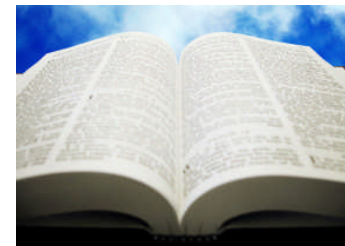
Conference was rich in God's word!