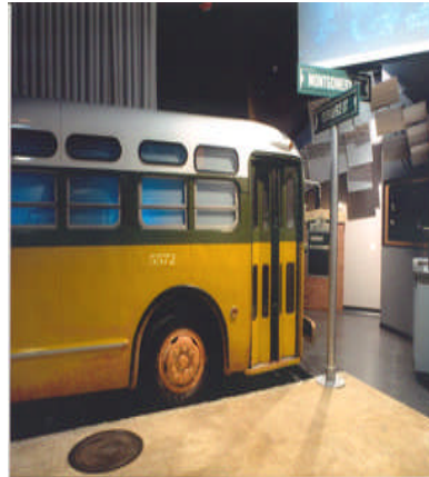
A replica of the infamous bus.