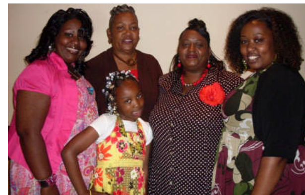
Three generations of this family in attendance