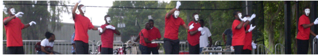
C.O.M. TIP at the Fifth Avenue Arts Festival