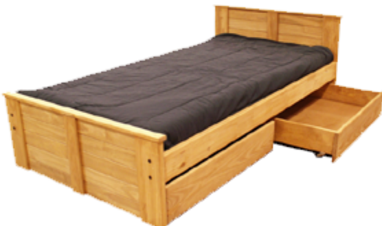
Shown with optional #3050 Roll-Out Storage Unit