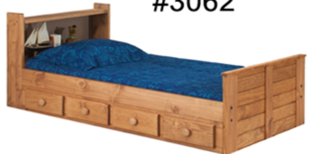
Shown with optional #3960 Four-Drawer Under Bed Unit