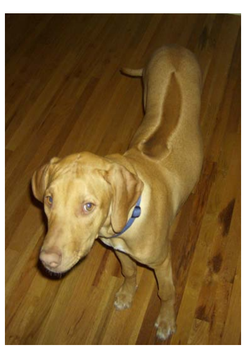
Female 24" 50 Pounds 5 months old