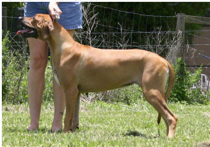
Female 26" 90 Pounds