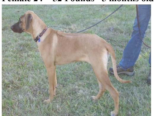
Female 24" 52 Pounds 5 months old