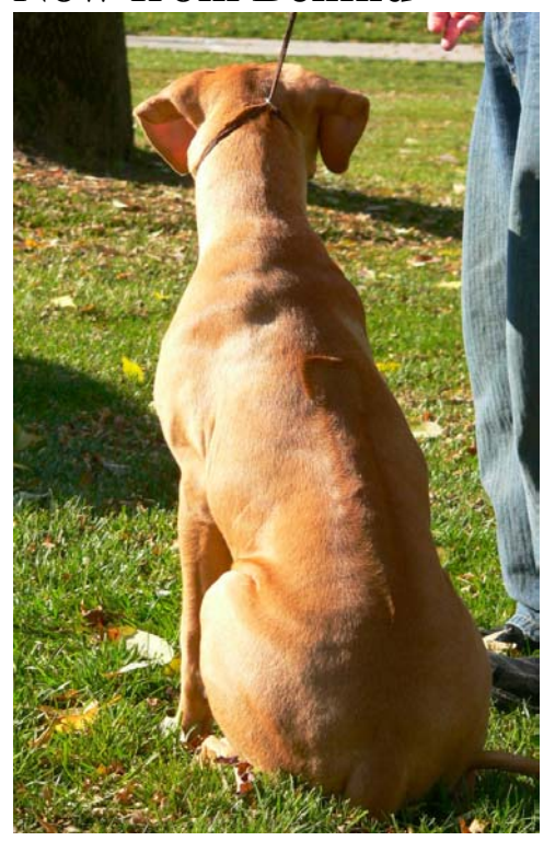
Male 24 ½" 60 Pounds