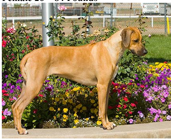
Female 26" 84 Pounds

note: She could stand to lose 3-5 pounds to