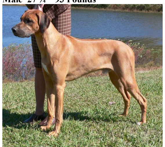
Male 27 3/4" 93 Pounds