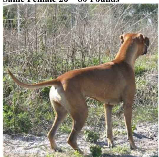
Same Female 26" 80 Pounds

ribs to be seen. Fat chest sticking out the front.