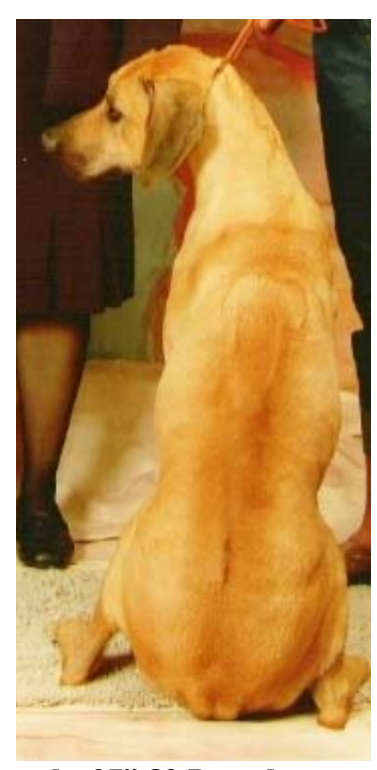
Female 27" 89 Pounds