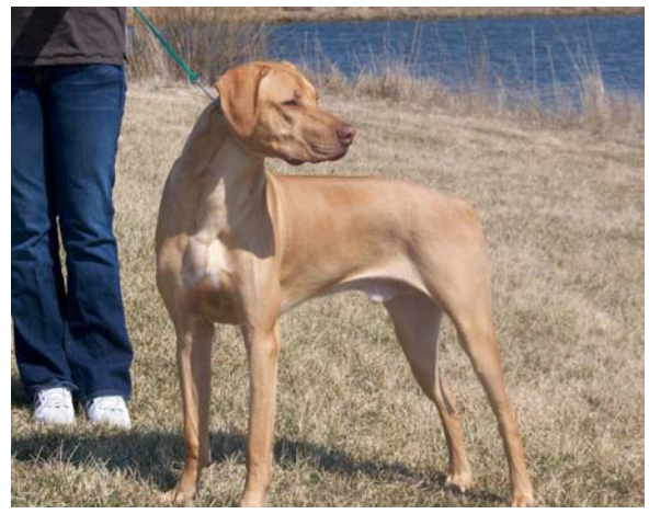
Male 26" 75 Pounds 9 months old