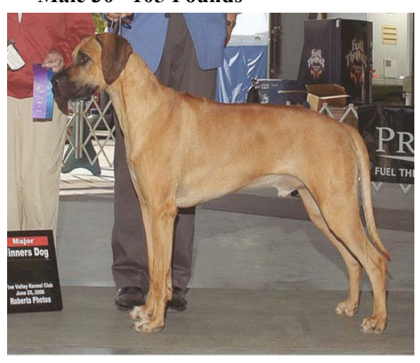
Male 30" 105 Pounds