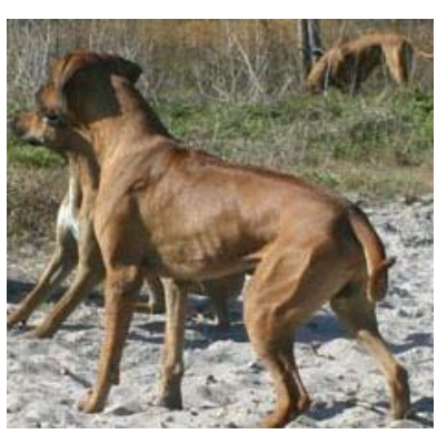
Male 28" 98 Pounds LEAN