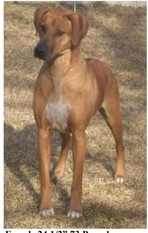
Female 24 1/2" 73 Pounds