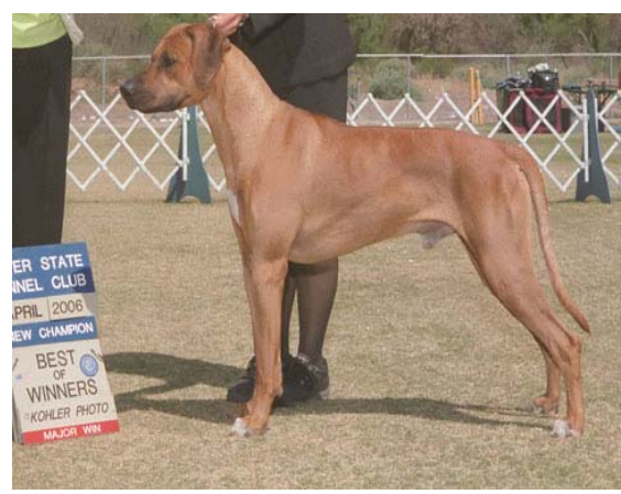
Male 27" 89 Pounds 2 years old