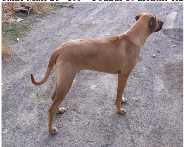
Same Male 28" 100 + Pounds 10 months old