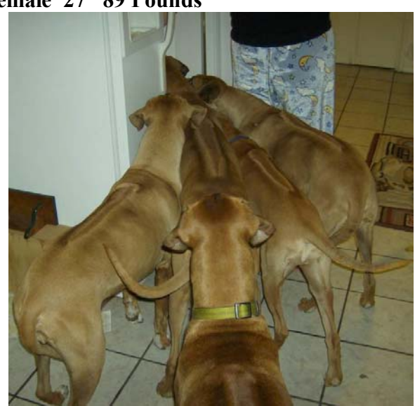
How do Ridgebacks get FAT?