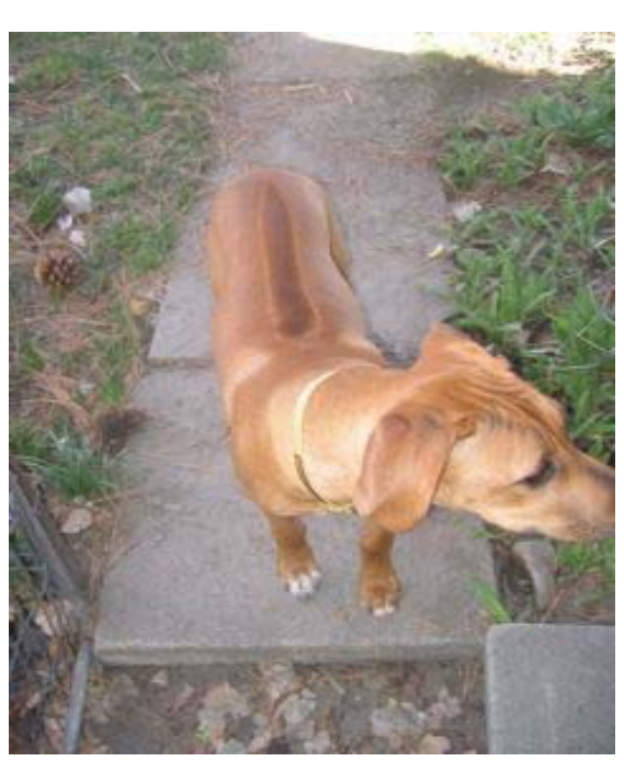
Male 23" 50 Pounds 5 months old