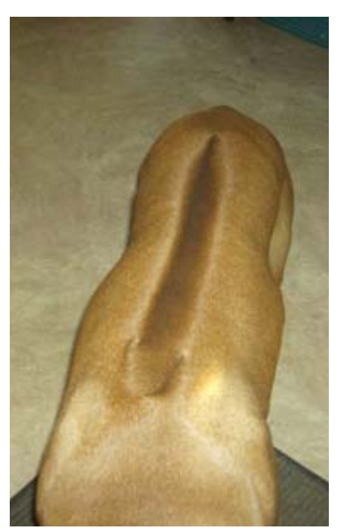
Male 28 1/2" 98 Pounds