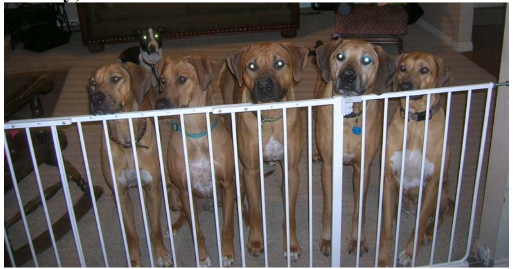
Big Heads, OK! Big, Fat, Flabby Chests? No Way!