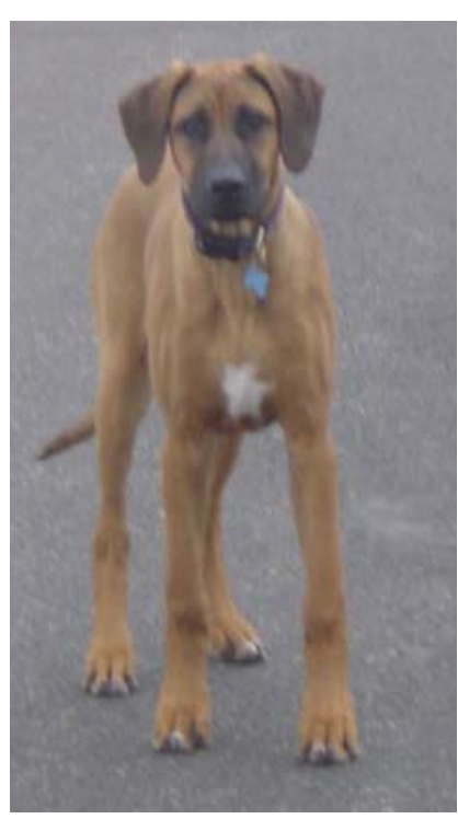
Male 24 1/2" 50 Pounds 5 months old