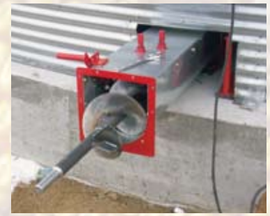
1/4-Inch (6-mm) Thick Auger Flight Is Easily Removed And Reinstalled From Outside The Bin

Available For 36-Through 60-Foot (11 to 18.3 m) Diameter Bins