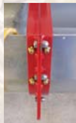
Sturdy Flange Connections