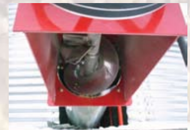
Power Head Discharge