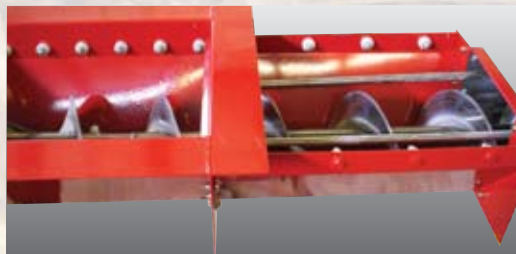
Extra Large Center Well With Wear-Resistant Slide Gate Rollers Shown