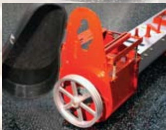
Reliable 3-Belt Pulley

NOTE: This Unload System's Output Quickly And Easily Adjusts To Match Your Existing Transfer System – Maximum Output Requires 8,000 BPH Transfer Auger