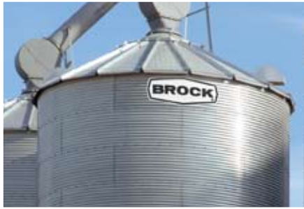
A grain bin-style roof with a higher load rating is standard on larger diameter hopper bin models; economical hopper bin-style roof is standard for smaller models.