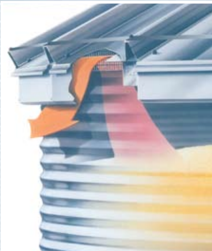
Patented BROCK® Eave-Vent System provides more total bin ventilation and eliminates the need for roof cuts.