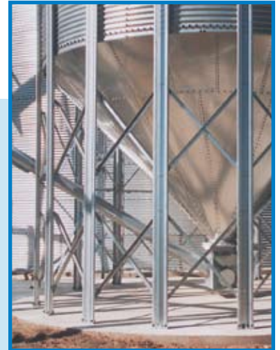
Sturdy "X" bracing between legs gives additional bin strength. Bracing is simple to assemble and offers access to boot.