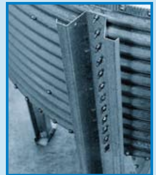
Bin legs are formed from all-galvanized steel for superior fit, durability, and strength.