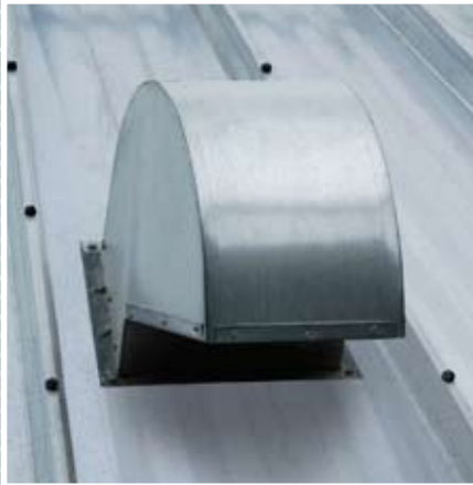
Gravity roof ventilators provide free air movement into the bin. Elbow-style (shown) and round mushroom-style vents are available.