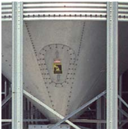
Brock's ACCESS PLUS® Hopper Access Door gives easy access to the interior of the holding bin.