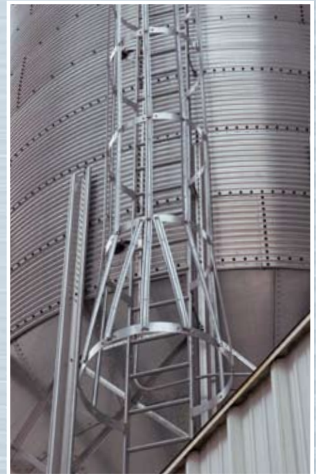
Ladder Safety Cage is standard for ladders on bins with an eave height of over 20 feet (6.1 meters).