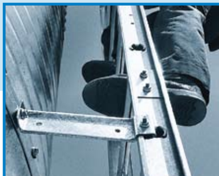
Side ladders allow plenty of space between rungs and bin wall for a secure footing.