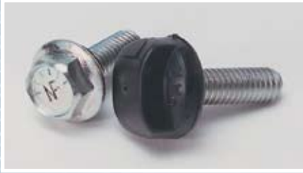
High strength Grade #8.2 bin assembly bolts are available with either the JS-500™ rust-resistant coating or rust-proof polypropylene-encapsulated head. JS-500 is not owned or licensed by CTB and is the sole property of its respective owner.