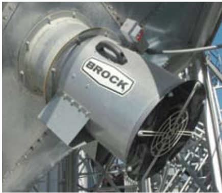
BROCK® Field-Proven GUARDIAN® Fans are designed for maximum in-bin aeration efficiency.