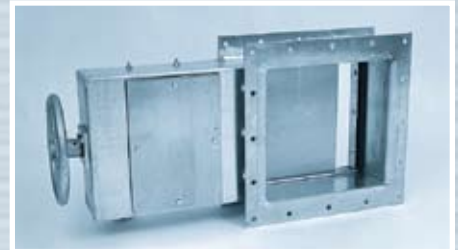
The hopper's discharge opening may be equipped with heavy-duty rack and pinion or roller-style unloading gates.