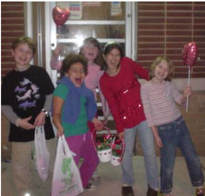
VERB youngsters enjoy giving a party!