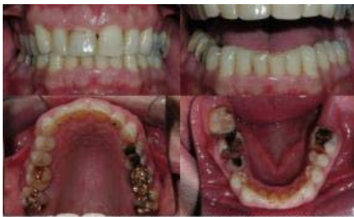
There can be so many reasons a mouth ends up in this condition. These factors need to be uncovered and addressed if long term success is to be expected. Occlusal mis-engineering is a factor. TMJs and muscles were fortunately unaffected. There are periodontal concerns but more from an esthetic and restorative perspective. The main issue is breakdown of tooth structure.

Past "Clinical Tips" Now Conveniently Archived For Easy Review