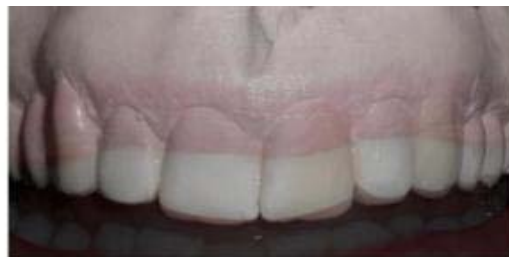
Superimposing the pre-op clinical photo over the wax-up helps to visualize the changes.