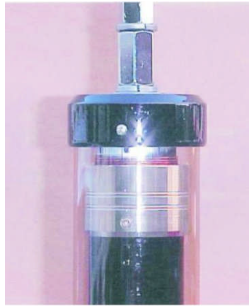
Little Tarheel II in 10 meter position with 32" whip