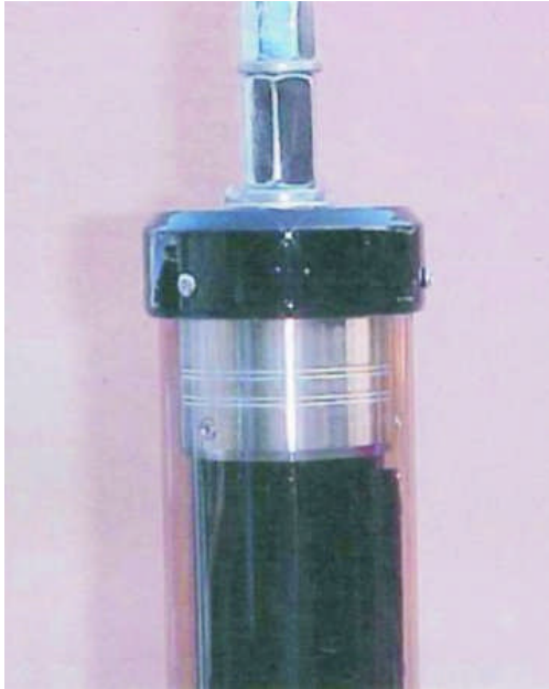
Little Tarheel II in 6 meter position with 32" whip

The following photos will show you relative tuning positions of the Little Tarheel II antenna.