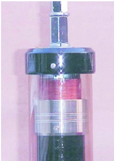
Little Tarheel II in 20 meter position with 32" whip