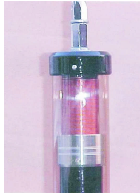
Little Tarheel II in 40 meter position with 32" whip