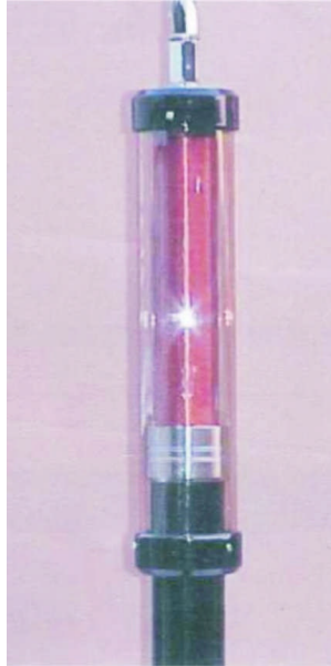
Little Tarheel II in 80 meter position with 32" whip