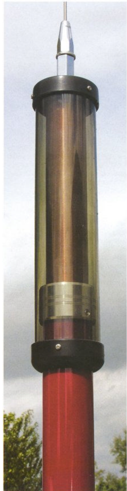
The adjustable coil, seen here in the 80m position, is well made of fairly heavy gauge copper wire and is protected by a transparent plastic sleeve..

The Little Tarheel II antenna is available for £279.95 from Moonraker, 01908 281705. Thanks to Moonraker for the loan of the review sample, and to G3NIE, G3MBM and G6HMF for assistance with testing.