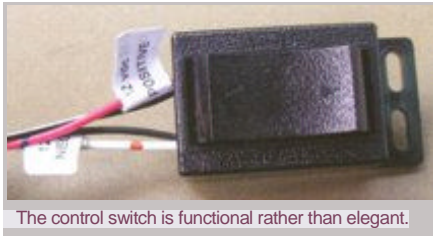
The control switch is functional rather than elegant.

IN USE. I fired up my radio and tuned it to 3.755MHz. Next, I pressed the rocker switch to start the coil lengthening. The coil