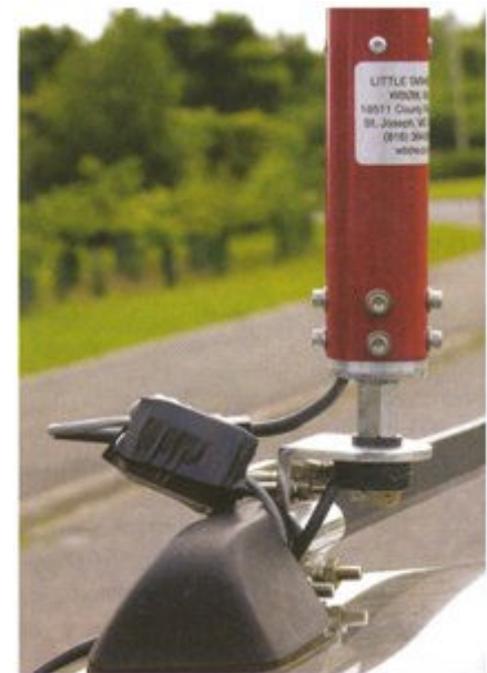
The antenna requires a meaningful mounting bracket. The control cable ferrite core (foreground, left) is wrapped in insulating tape.

The next challenge was to fit the ferrite core to the motor control lead. The instruction manual recommends that the ferrite should be mounted as close to the antenna as possible so that it decouples the antenna from the control wire and reduces motor electrical noise during tuning. It also acts as a handy anchor for the cable when the antenna is off the car! The ferrite accepts several turns of the control cable, and clips together. I put a layer of insulating tape over it to provide some measure of weatherproofing.