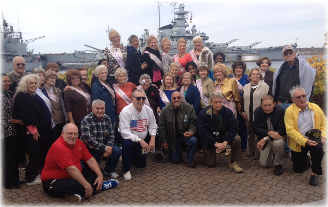
A few years ago our entourage went to Heritage State Park and visited the Battleship Massachusetts at battleship Cove in Fall River, The Big Mamie". Tours are a great added attraction to a trip to the Ms Senior Sweetheart Pageant. You never know what's coming up next. Newport Playhouse, anyone? Duck boats?