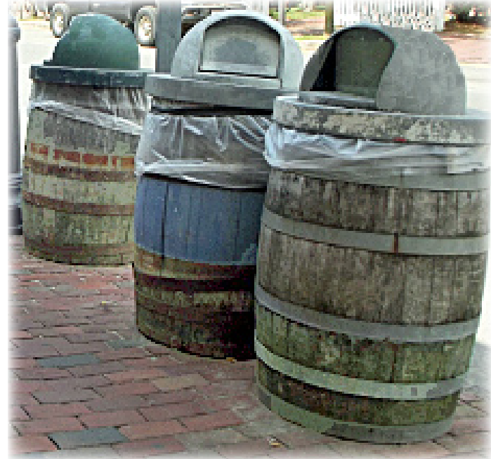
On Nantucket Island even the trash barrels have character.