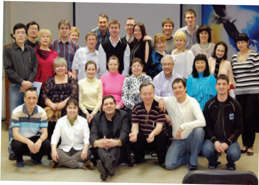
More than 90 of over 120 Methodist pastors and lay preachers have received training at the Moscow Theological Seminary.

With the fall of the Soviet Union in 1991, many people turned to religion to find fulfillment and spiritual strength after 73 years of communist rule. Christian churches started spreading the Gospel throughout the huge territory of Eurasia.