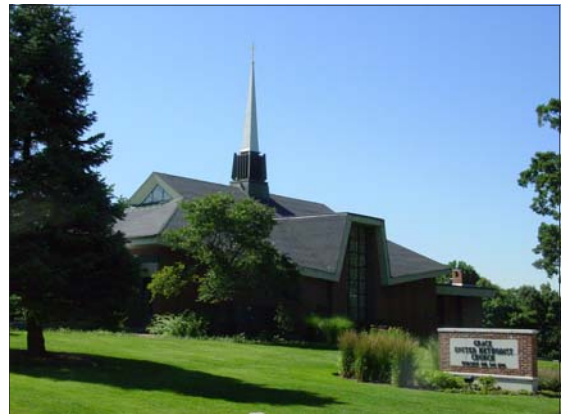
Among other responsibilities, the Grace Board of Trustees makes sure our building is at its best.