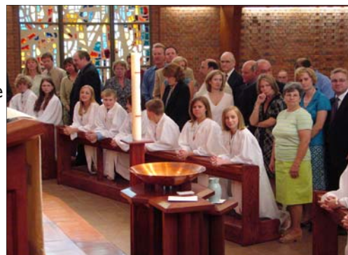
Parents, grandparents and mentors surround their confirmands with love and support.