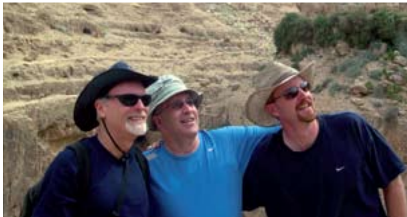
For More Information Please Contact:

We need the final Rooming and Name list. The full payment (BALANCE) must be wired to our below bank account;