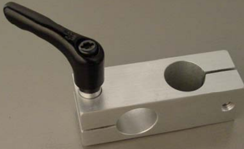
Knuckle with Single Handle Part #1000-H-RA