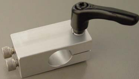
End Knuckle with Handle Part #1100-H-RB