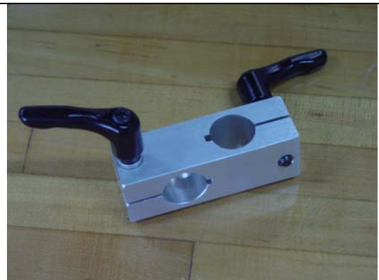
1002-HH-RA Knuckle with double key and double handle