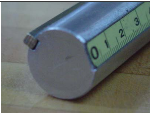
3010-XXmm-90 (XX= Length – mm) Metric length rod with key and scale, 90 degree offset