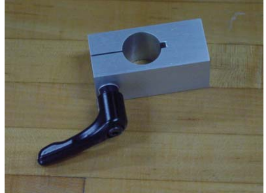
1001-H-RA End Knuckle with Key and Handle