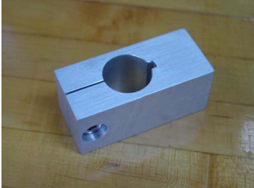
1001-RA End Knuckle with Key