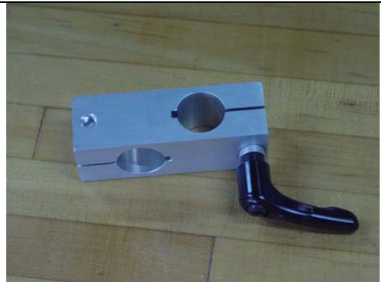
1002-H-RA Knuckle with double key and single handle