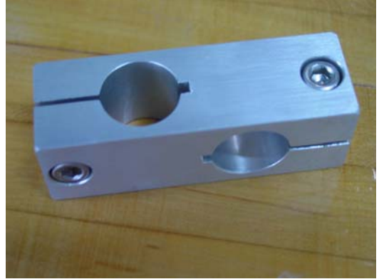
1002-RA Knuckle with double key