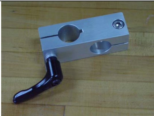
1001-H-RA Knuckle with Single Key and single handle