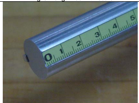
3010-XXmm-180 (XX= Length – mm) Metric length rod with key and scale, 180 degree offset