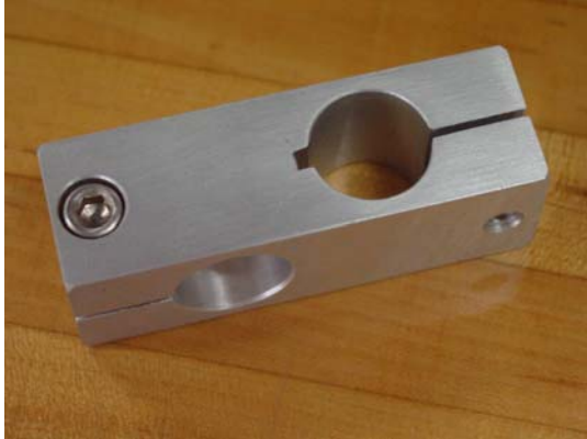
1001-RA Knuckle with single key