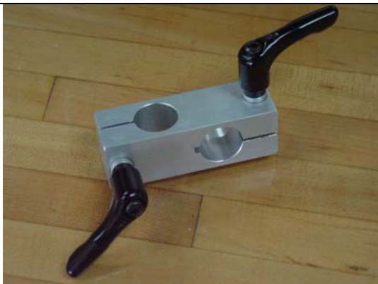
1001-HH-RA Knuckle with single Key and double handle