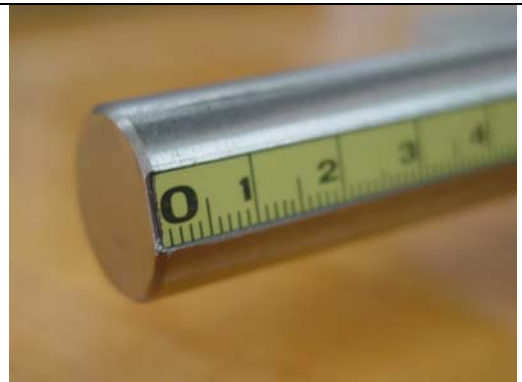
3010-XXmm (XX = Length - mm) Metric length rod with scale 3010-XX.XXin (XX.XX = Length – inches) English length rod with scale