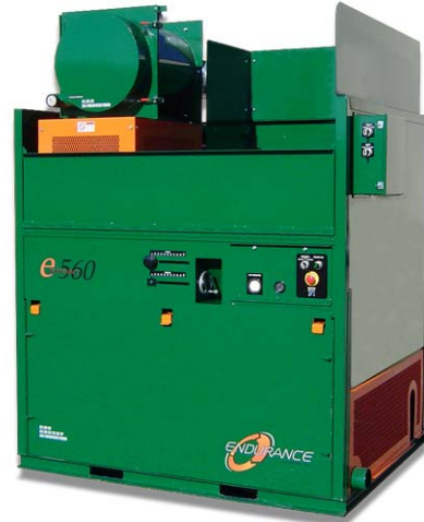
e560 SYSTEM WITH RECLAIM ATTACHMENT

With over 75 years of experience in the insulation application industry, Endurance has designed a patented, versatile, multi-fiber, field proven insulation application system. Endurance insulation application systems are designed to provide the professional contractor with unparalleled performance and the potential opportunity of a high return on investment.