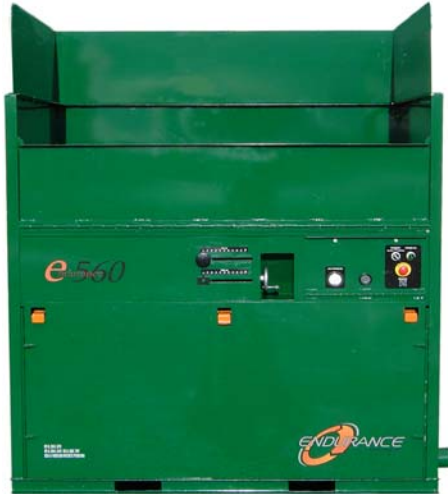
e560 ATTIC SYSTEM

1274 South Adams St. Bluffton, IN 46714 Ph. 260.827.0491 Fax 260.827.0490 www.EnduranceInc.net