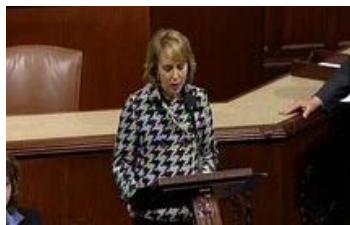
U.S. Representative Gabrielle Giffords of Arizona addresses the United States Congress in this still ...