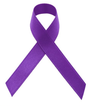
October is Domestic Violence Awareness Month