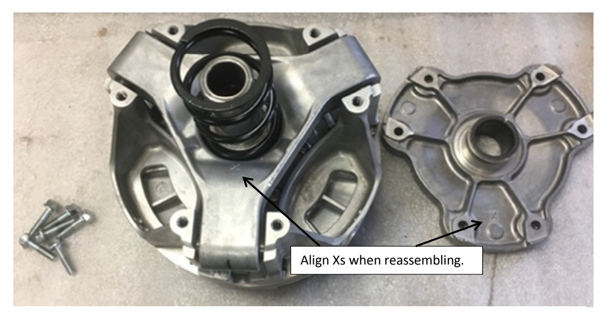
3. Ready to remove and install flyweights.