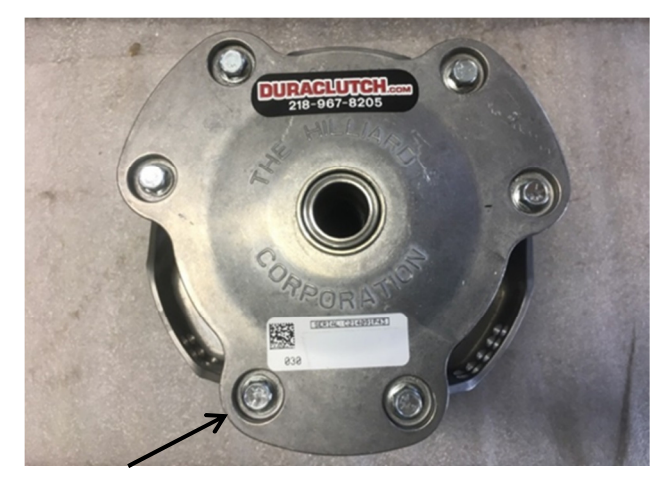
2. Remove 6 cover screws with <sup>3</sup>/<sub>4</sub>" socket.