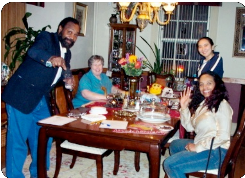
Having some fun at the May 16 YCoG Meeting