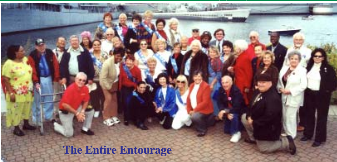
The Entire Entourage